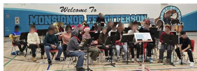
Junior High Band Students