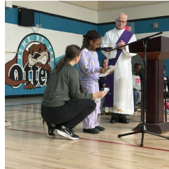
Grade 1 Readers