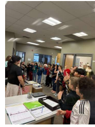
Caroling in the School