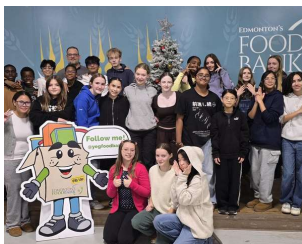
Junior High Leadership Students