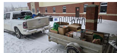
On Its Way