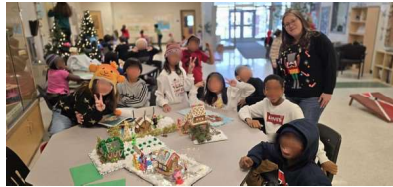
Traveling Christmas Stations