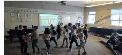
Fun, Fun, Fun